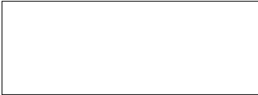
Figure 2. An example figure